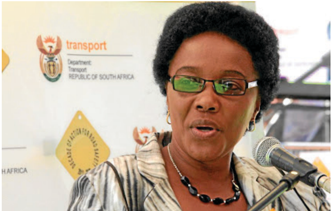
Minister of Transport Sindisiwe Chikunga

She said the AARTO Act will reinforce other interventions such as classifying traffic policing as a 24-hour, 7-day job, alongside the regulation of driving schools and introduction of a National Qualifications Framework (NQF) level 6 training for traffic law enforcement officers.